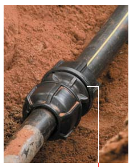
5. Check for Correct Installation Ensure the nut is tightened until flush with the flange on the body of the fitting. Fitting is now fully installed.