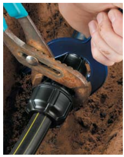
4. Nut Tightening The nut should be tightened by hand and then firmly with a wrench. Tighten the nut until it just touches the flange on the body of the fitting.