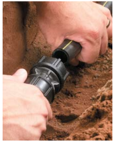
2. Ready to Use Position The fitting is pre-assembled and ready to use, however always ensure the nut is fully relaxed and 2 threads are showing before inserting the pipe.

Chamfering or lubrication is not required.