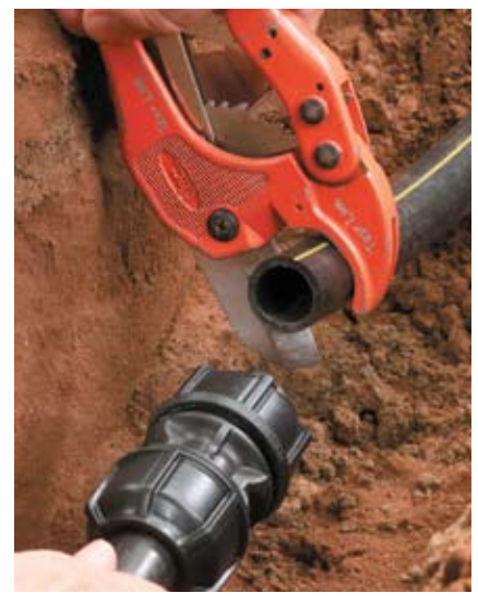
I. Cut Pipe Square Cut the pipe square. There is no need to prepare the pipe end.

Chamfering or lubrication is not required.