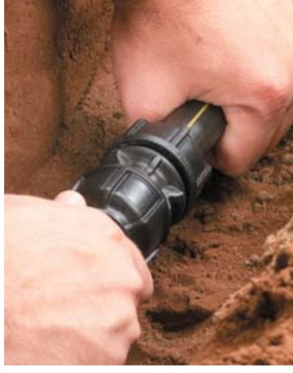
3. Pipe Insertion Insert the pipe until the first point of resistance is felt.